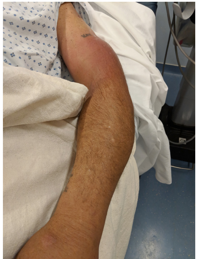
Figure 1 Left upper extremity examination findings.